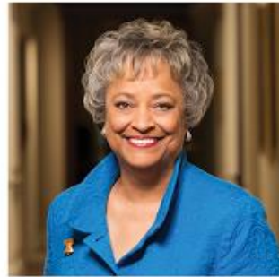
Kay Coles James