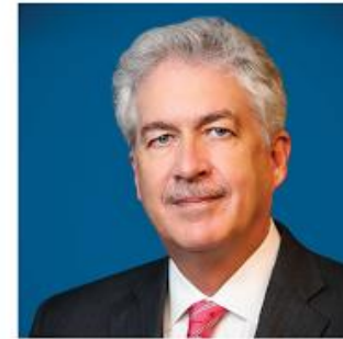
William Joseph Burns